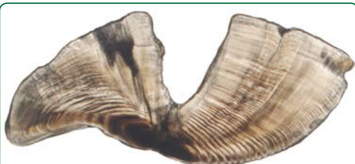
Section of an otolith from a 70-year old western blue groper.

The otoliths, used by fish to balance and hear underwater, lay down growth rings every year in a similar manner to tree trunks. Researchers count the growth rings to build a picture of the abundance of each 'age class' in the population of a fishery. This information is used to gain an understanding of the impact of fishing on the stocks of species.