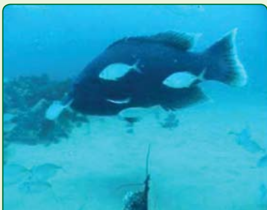
The western blue groper has few natural predators once fully grown.

For a slow-growing species such as western blue groper that has few natural predators once fully grown, important signals that populations are being overfished may include a decrease in the maximum age of fish and in the proportion of older fish being sampled/caught.